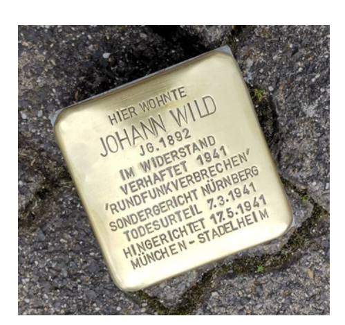
The 100,000th stone in Nuremberg, Germany.