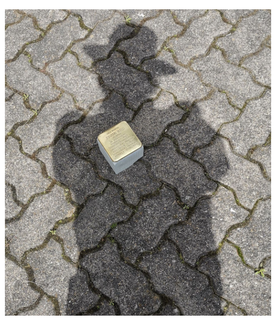
The 100,000th stone & the shadow of Gunter Demnig.